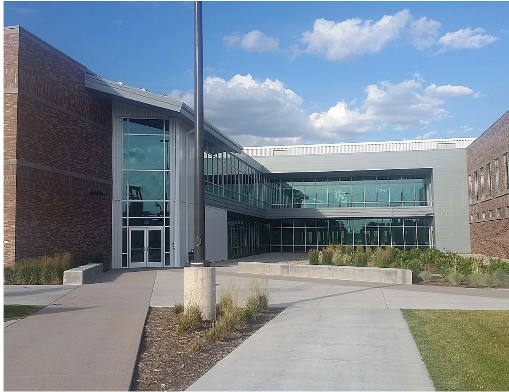
Surrounding Campus Buildings