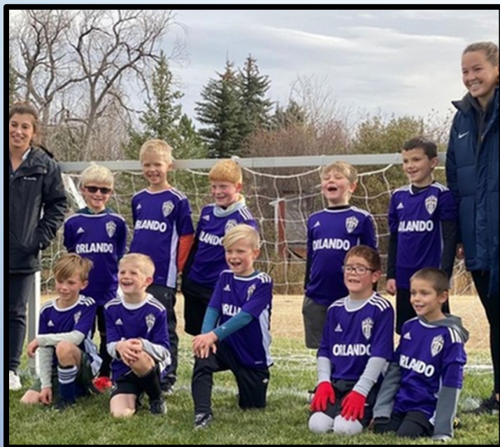
Women's Soccer Team