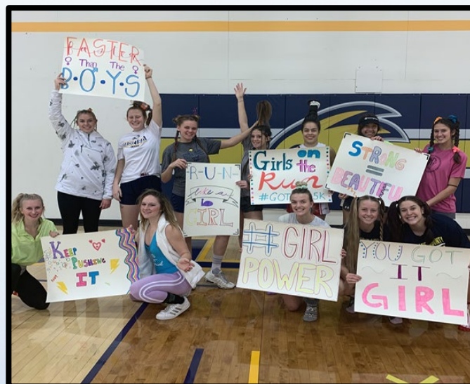
Women's Basketball Team