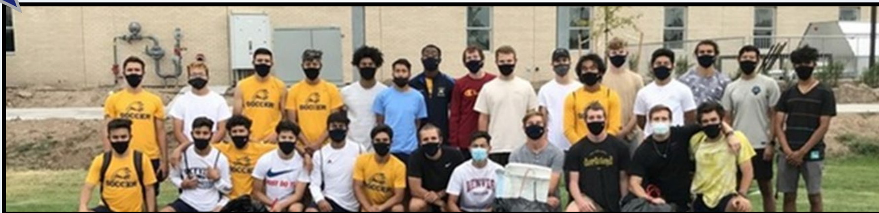
Men's Soccer Team