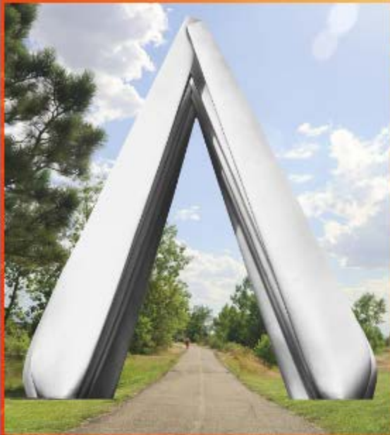
WIND CATHEDRAL East view