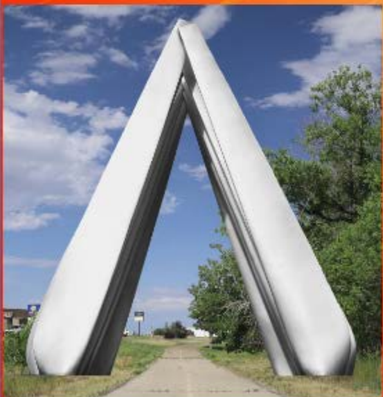
WIND CATHEDRAL West view