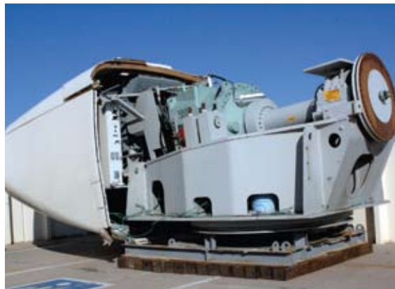
The wind turbine cell, donated by Duke Energy, acts as a hand-on learning environment for budding wind energy technicians.