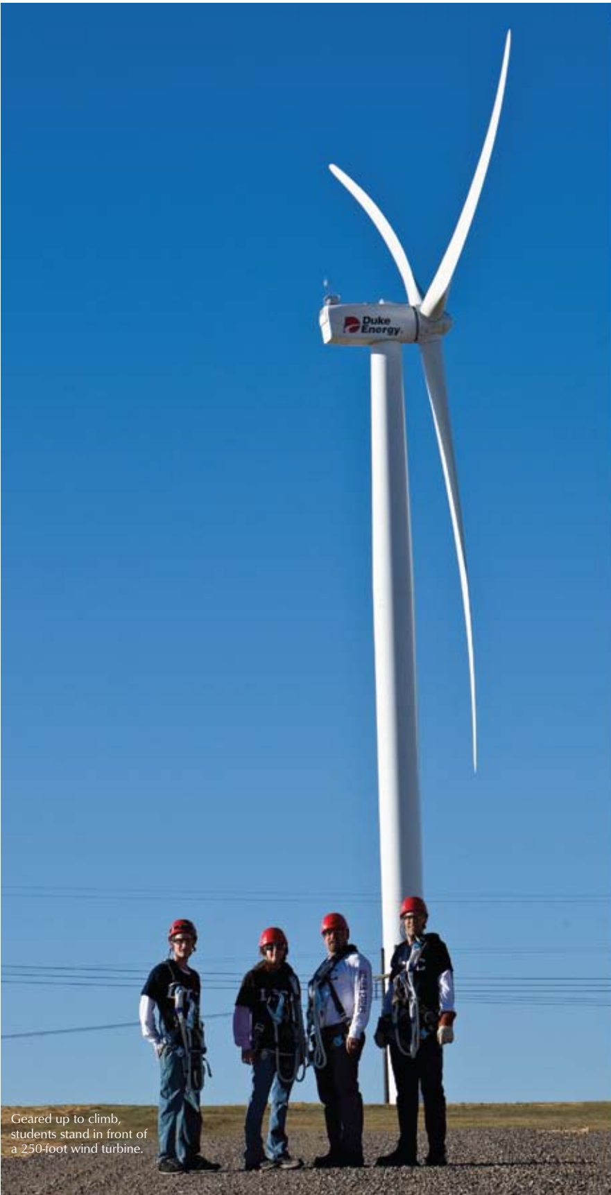
Geared up to climb, students stand in front of a 250-foot wind turbine.

For those interested in joining the program, there are three options available. Students may earn a Basic Wind Technician Certificate, an Associate of Applied Science degree or an Associate of Science degree.